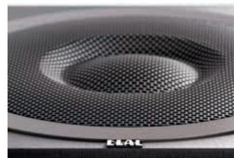
▲ S10 grille