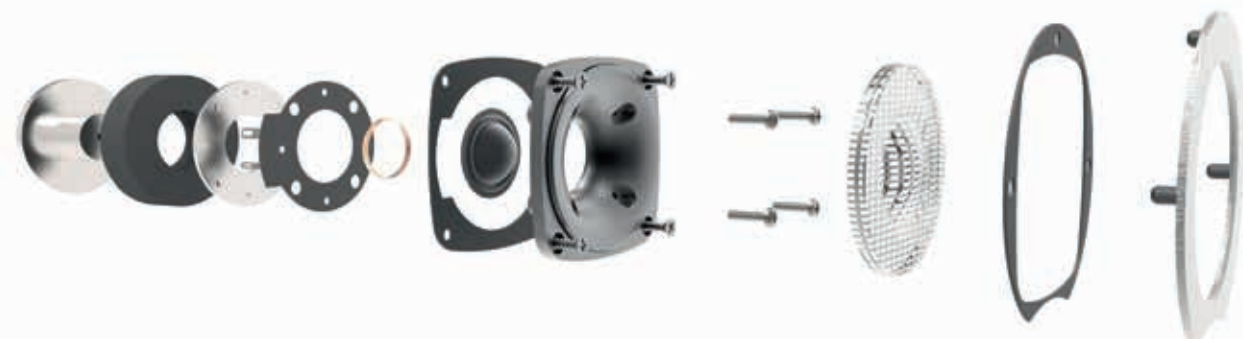
▲ Exploded view of the Debut Line tweeter