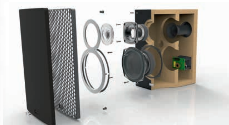
▲ Exploded view of the Debut Line bookshelf loudspeaker

Errors and omissions excepted. Specifications and design features subject to change without notice.